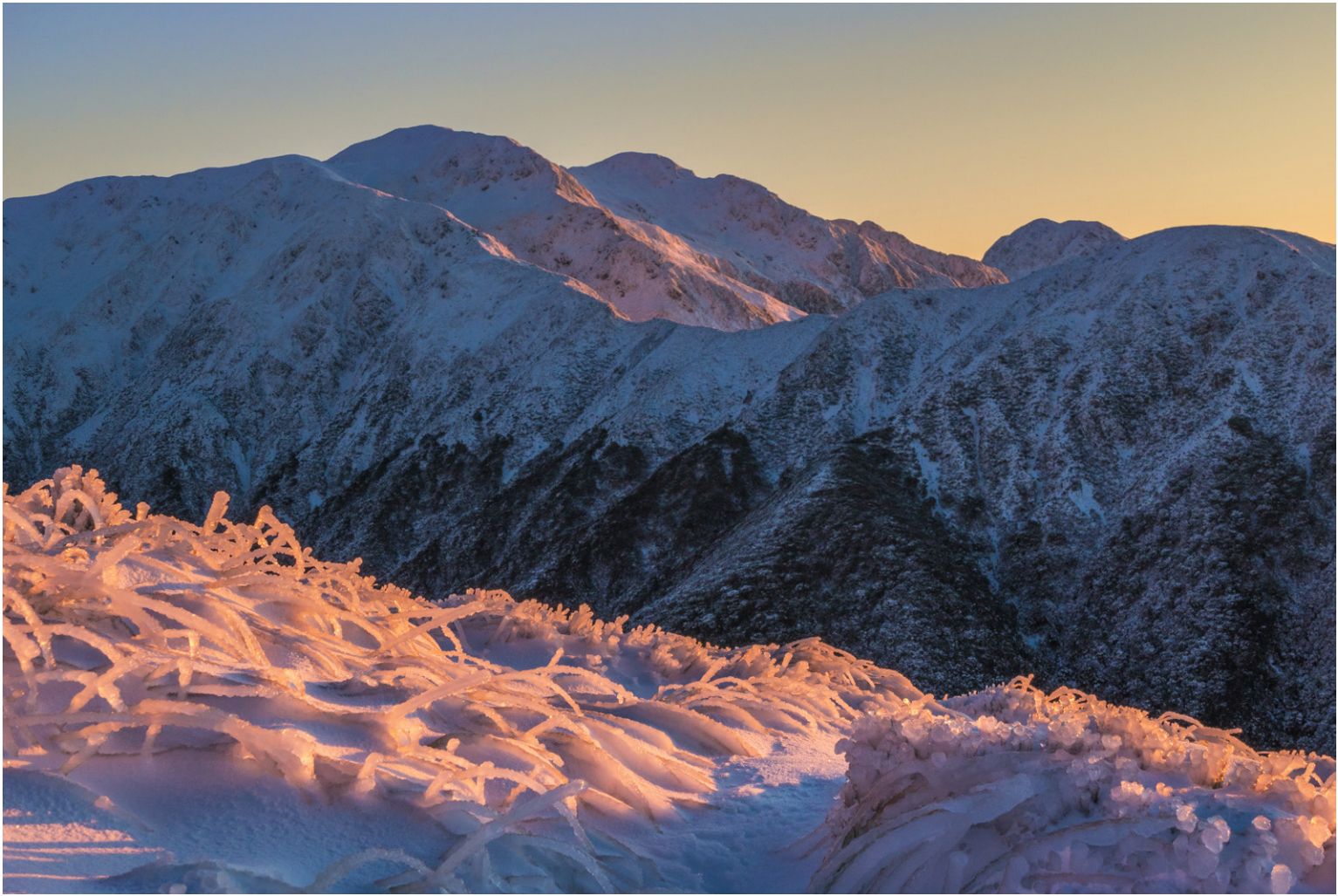
The Three Kings (centre), Mitre (at 1,571m the highest peak in the Taranaki Ranges, right) and Baldy Ridge, viewed from near Jumbo Hut (1,220m) at dawn