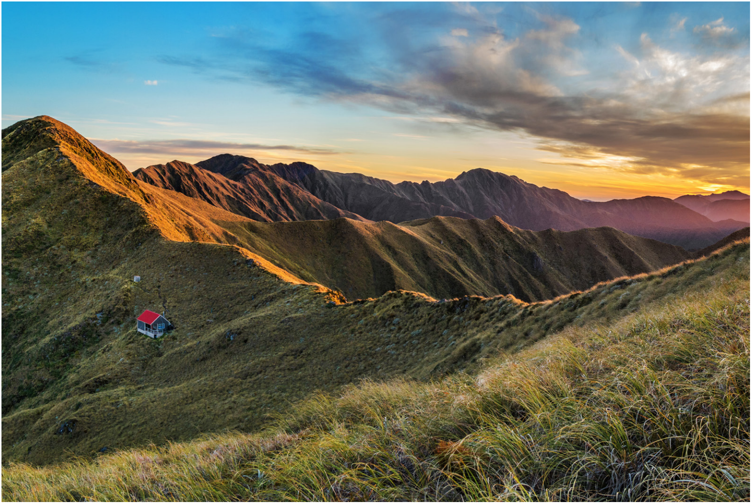
Sunset view south from above Tarn Ridge Hut (1,360m), to Adkin, the Three Kings, Broken Axe Pinnacles and McGregor, with Dorset Ridge middle foreground