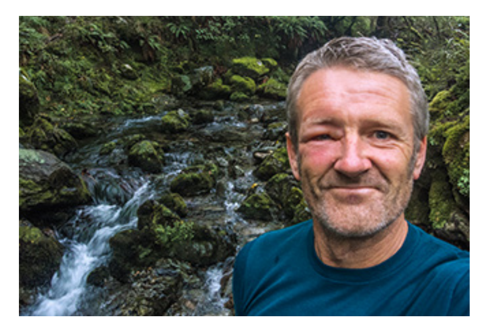
The result of a wasp nest encounter on the trail (if you can call it that) below Baton Saddle