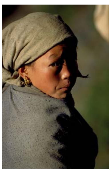
For instance, if, back in 1998, I'd read "Many people come; looking, looking" prior to setting forth from Lukla, I wouldn't have so ignorantly enjoyed that hot shower at Namche Bazaar. Back then the hot water came from fires stoked by already seriously depleted forests. That said, next time I return to Namche Bazaar, I may well enjoy a hot shower, because the water will likely be heated by hydro-electricity, or even better, solar power. Good lessons are being learned as international tourism expands in the Himalaya but, as the sayings go, "it takes two to tango" and "every little bit counts".

Galen Rowell constructed his account of the Himalaya around a characteristically insightful comment made by a Lama at Thyangboche Gompa, who said "Many people come; looking, looking, taking picture. Too many people. No good... Some people come, see. Good!" The Himalaya will never again be as it was before international tourists began arriving. That can be said for all places inhabited by man. But this doesn't mean that its magic has to become a distant memory. In future let's make sure that we do see, so we're able to show due respect and conduct ourselves accordingly. Then perhaps everyone can continue to enjoy the magic of the Himalaya. As a father of three boys that is certainly my hope.