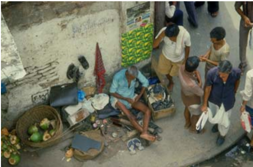
A street merchant in Calcutta

We gave little further thought to that far away alpine region until finding ourselves sweltering in Calcutta. It was May, 1988, the pre-monsoon 'crazy season', with temperatures over 40 degrees Celsius coupled with 95% humidity and above. These conditions aren't easy to contend with at the best of times and, when the mayhem of Calcutta is the back drop, it was positively daunting. But the City of Joy served as the complete contrast to what we were about to experience further north in Darjeeling. Our visit to Calcutta wasn't really very joyous at all, but it did highlight the special qualities of my first Himalayan experience.