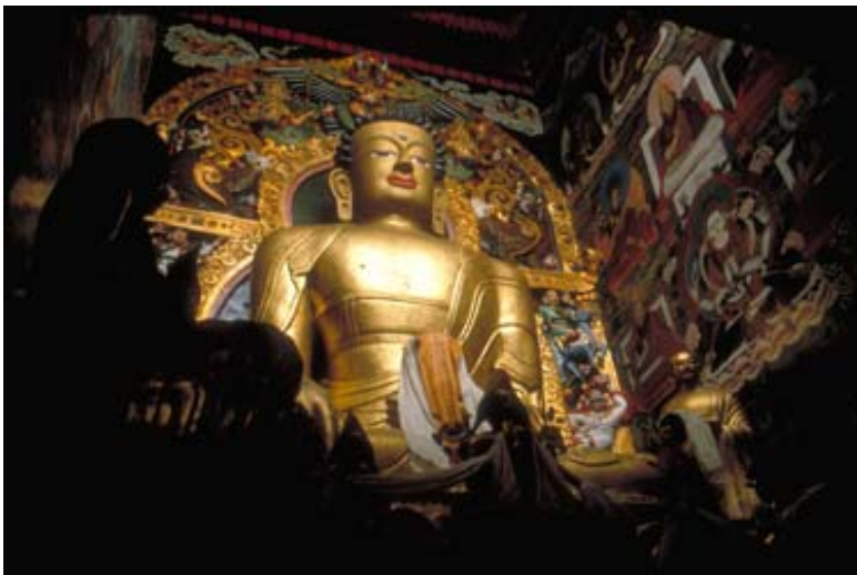
Hinduism, Buddhism and Christianity all coexist in Darjeeling

It was immediately apparent that all was not as it should be in Darjeeling. The narrow, meandering, cobbled lanes were all but empty and several hotel construction sites had obviously been abandoned in various stages of non-completion. Little green flags dotted the scene. The southern end of Darjeeling, where we now stood, was populated (at least outwardly) mainly by GNFL sympathisers. The West Bengali government supporters held the northern end, hanging out little, red, hammer and sickle flags to signifying their loyalties.