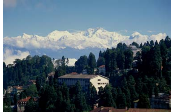
A view of Kanchenjunga and Darjeeling

The upside consequently, was that we were well prepared to appreciate to the fullest, any positive changes to our immediate environment, bodily condition or fortunes. And as we switch-backed our way up the 85 km ribbon-like road between Siliguri (approximately 200 metres above sea level) and Darjeeling (2,123 metres) things did improve steadily. The views became increasingly panoramic and the temperature fell, helping us to savour them in greater comfort. We were getting our first taste of the heightened well being obtained when at higher altitudes in cooler, clearer, cleaner air. It is a pleasure I still crave whenever I'm conscious of the stresses of life in the big city.