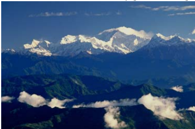
Kanchenjunga on a clear morning

When this finally happened, I was staggered by the grandeur of the sight before me and realised why the Himalaya was so named. 'Himalaya' stems from the Tibetan words Ima and Laya, meaning 'land of snows'.