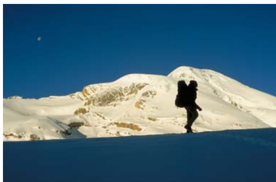
Left, an example of the often more gentle profiles of the mountains on the southern side of the Himalayan divide; contrasting, right, with the younger, more jagged profiles of Karakoram peaks

Running parallel to, but north of the Abode of Snows, and separated by the upper Indus River, is the Karakoram. This is a 500 km stretch of particularly unstable, serrated mountains that jut into the sky like the teeth of a gigantic, multi-bladed saw.