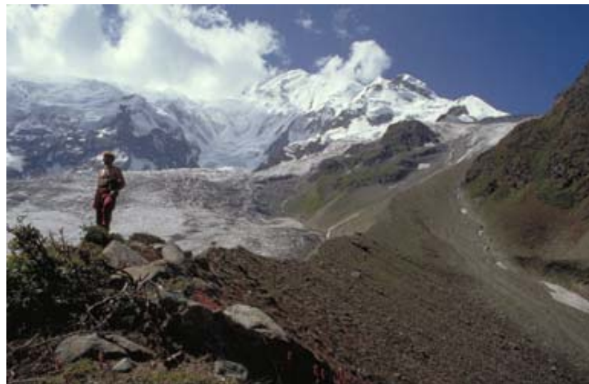
Above, a clear autumn day in the khumbu Top right, a sand storm in Tibet Right, below Rakaposhi base camp in late August, Karakoram