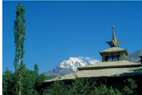
Left, Buddhist images inside Samye Monastery, Tibet Above, a mosque in Baltistan Right, a Hindu shrine at Nagarkot, Nepal